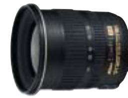
AF-S DX Zoom-Nikkor 12-24mm f/4G IF-ED (2.0x)