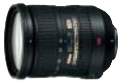
NEW AF-S DX VR Zoom-Nikkor 18-200mm f/3.5-5.6G IF-ED (11.1x)