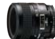
AF Micro-Nikkor 60mm f/2.8D