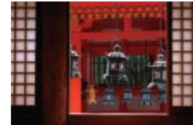
AF Zoom-Nikkor 28-200mm f/3.5-5.6G IF-ED (7.1x)