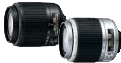
AF-S DX Zoom-Nikkor 55-200mm f/4-5.6G ED (3.6x)