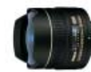
AF DX Fisheye-Nikkor 10.5mm f/2.8G ED