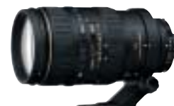
AF VR Zoom-Nikkor 80-400mm f/4.5-5.6D ED (5.0x)