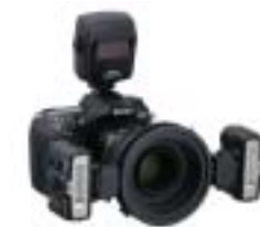
Nikon Close-up Speedlight Commander Kit RIC1