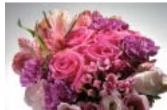
Shot with multiple flash units

Dimensions (W x H x D): Approx. 68 x 96 x 58mm Weight (without batteries): Approx. 160g