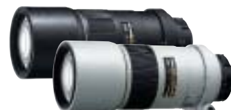
AF-S Nikkor 300mm f/4D IF-ED + TC-14E II