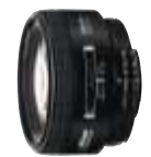
AF Nikkor 85mm f/1.8D