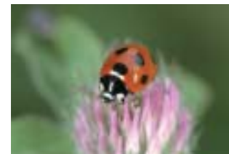
Shot with Nikon Close-up Speedlight Commander Kit RIC1