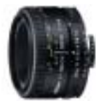
AF Nikkor 50mm f/1.8D